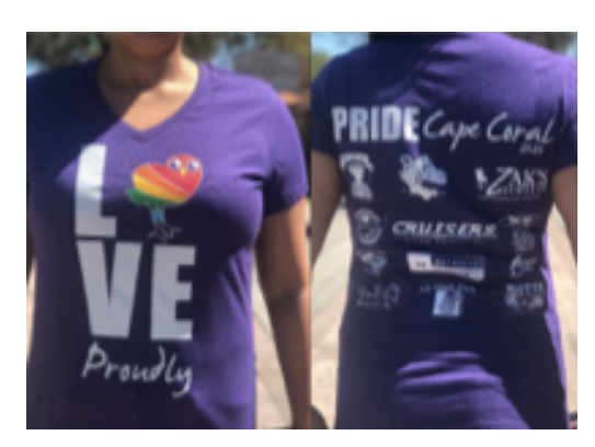
Front & back of 2020 sponsored shirt (women's v-neck)